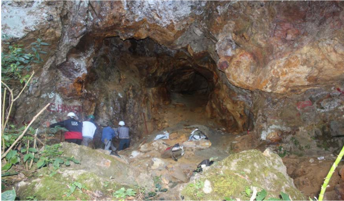
Figure 2 Mineralized Skarn Zones at Las Minas